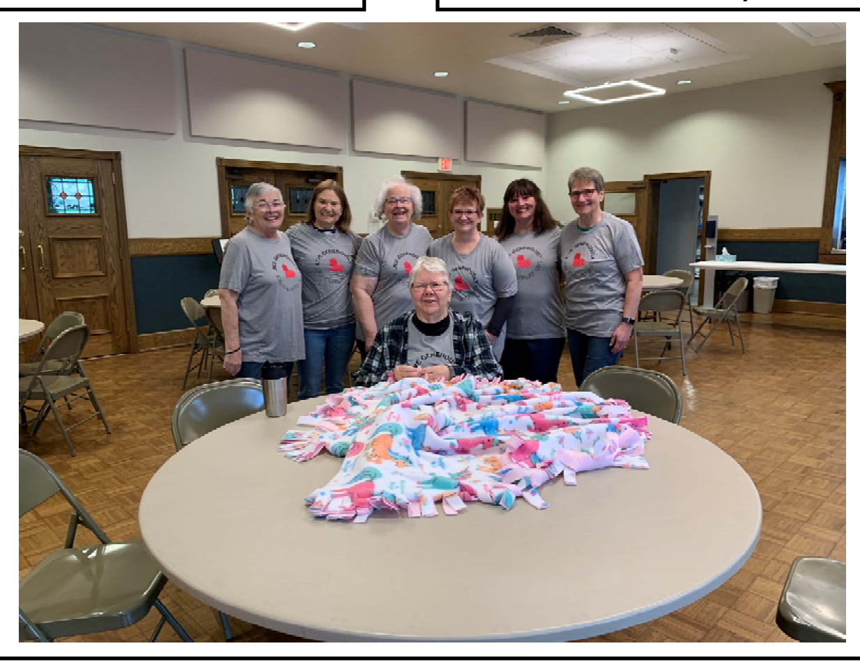
Trinity's Faithful Blanket Tying Crew