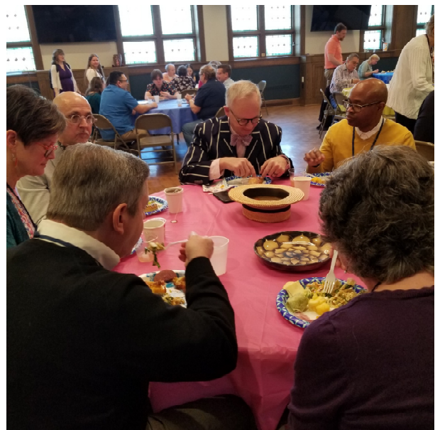
Easter Brunch April 9, 2023